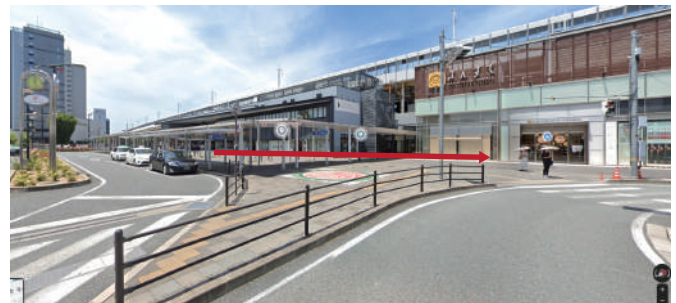
Leave Fukuyama Station "South Exit" and proceed to the left.